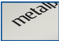
MATTE non-reflective with dull finish