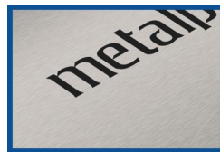
SATIN semi-gloss medium reflective material