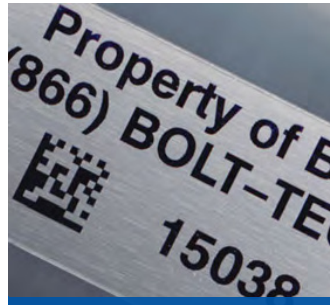
UDI Barcode Asset Identification