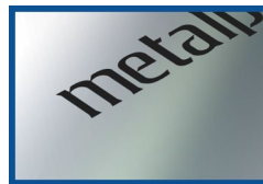
GLOSS highly reflective, mirror-like